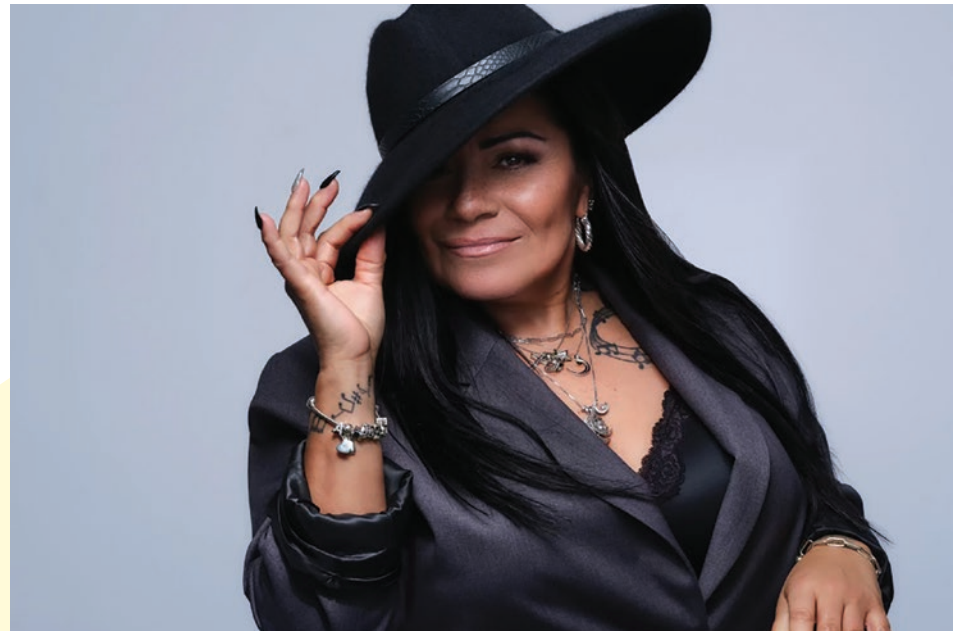
80s Hip Hop pioneer Lisa Lisa will headline the final night of this year's Summer Street Fest

Admission to the Summer Street Fest is FREE, with nominal fees for the food, beer garden, jumpers, and other activities. Event location, scheduled band performance times or appearances are subject to change. Follow us on social media for the latest information.